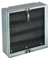
Premium Radiation Dampers