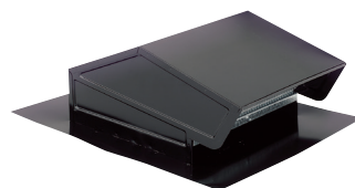
Roof & Wall Caps