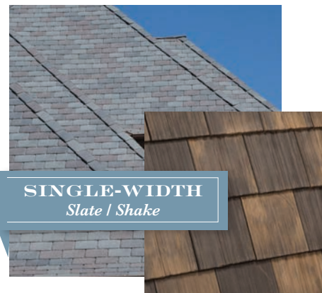
SINGLE-WIDTH Slate / Shake

Our most authentic-looking and versatile option. Laying tiles of multiple widths creates the most natural, non-repeating appearance possible.