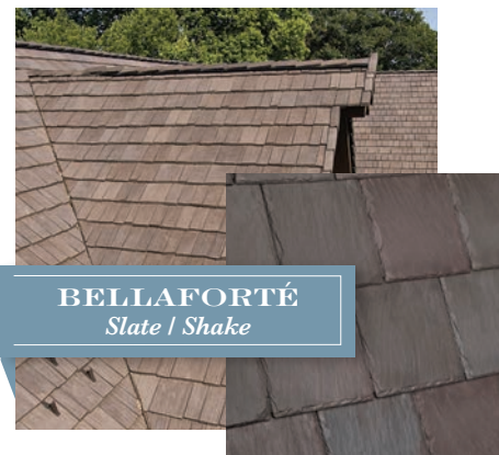
BELLAFORTÉ Slate / Shake

Single-width tiles add a budget-friendly touch of tradition to your home in either a straight or staggered pattern. The uniform tile size speeds up installation.