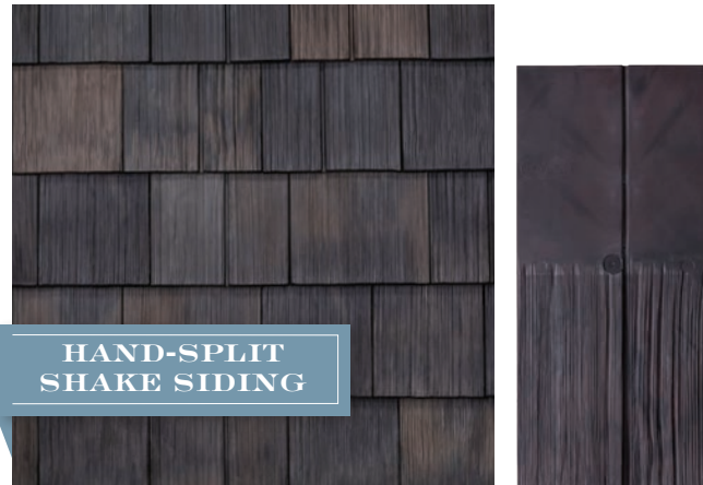
HAND-SPLIT SHAKE SIDING

DaVinci Hand-Split Shake Siding gives you the look you love with superior durability for a lifetime. The tiles are resistant to mold, algae, fire, pests, impact, and salt air while providing the craftsmanship and authenticity of natural, hand-split siding.