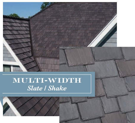
MULTI-WIDTH Slate / Shake

DaVinci Hand-Split Shake Siding gives you the look you love with superior durability for a lifetime. The tiles are resistant to mold, algae, fire, pests, impact, and salt air while providing the craftsmanship and authenticity of natural, hand-split siding.