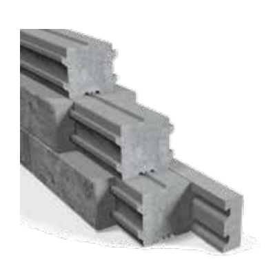
SureTrack™ Backer Blocks

Select a structural component for your finishing panels. U-Cara panels easily slide onto the built-in tracks of the Segmental Backer Block System , Prefabricated Modular System or Wall Mount System .