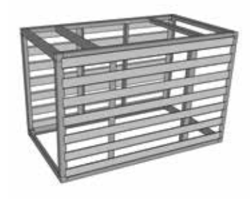
Fascia Panel Module Dimensions 32 ½" x 69 ½" (Outside to Outside) Height 45" including coping