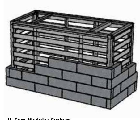
U-Cara Modular System