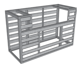
Fascia Panel Module Dimensions 32 ½" x 69 ½" (Outside to Outside) Height 45" including coping