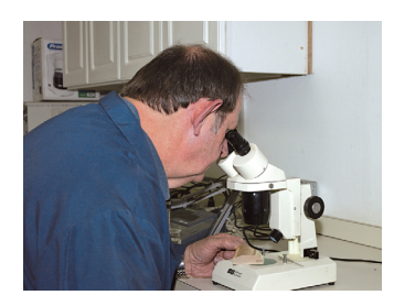
Cabinetry glue joints are examined to verify that maximum bonding was achieved during the manufacturing process. This ensures our customers receive a quality product.

Wellborn meets the quality and strength requirements of the KCMA, Kitchen Cabinet Manufacturers Association in ANSI/KCMA A161.1-2000, Performance and Construction Standards for Kitchen and Vanity Cabinets. Wellborn Cabinet has an in-house laboratory which performs the same testing to ensure our quality daily. Wellborn exceeds all specified requirements of the KCMA. Look for the seal of approval on your cabinetry.