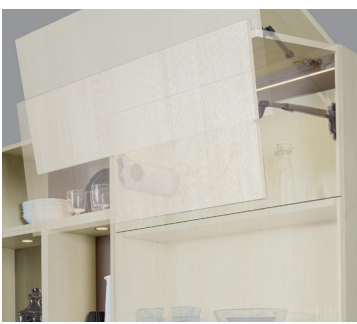
Touch to Lift