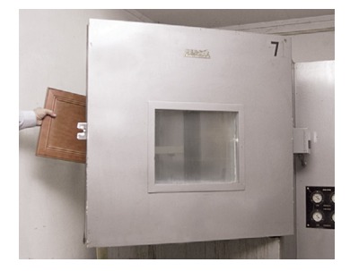
Our environmental test chamber emulates various environmental factors such as humidity and temperature variances to verify the strength of our wood and wood joints to meet KCMA requirements.