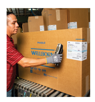
Wellborn's inventory control system uses bar code labeling for customized order information and up-to-the-minute counts.