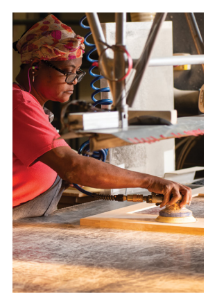
The face frames are hand sanded on the front and edges. The inside is hand sanded and hand rubbed to create a smooth protective surface.

The entire Wellborn family of employees takes great pride in producing quality products. Our Production Management Team along with over 100 Quality Control employees are dedicated to ensuring the quality of your cabinetry. Our certified inspectors oversee 30 quality checkpoints throughout the facility.