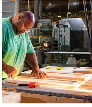
Each door is inspected for color variation and part defects to ensure Wellborn's standard of superior quality.