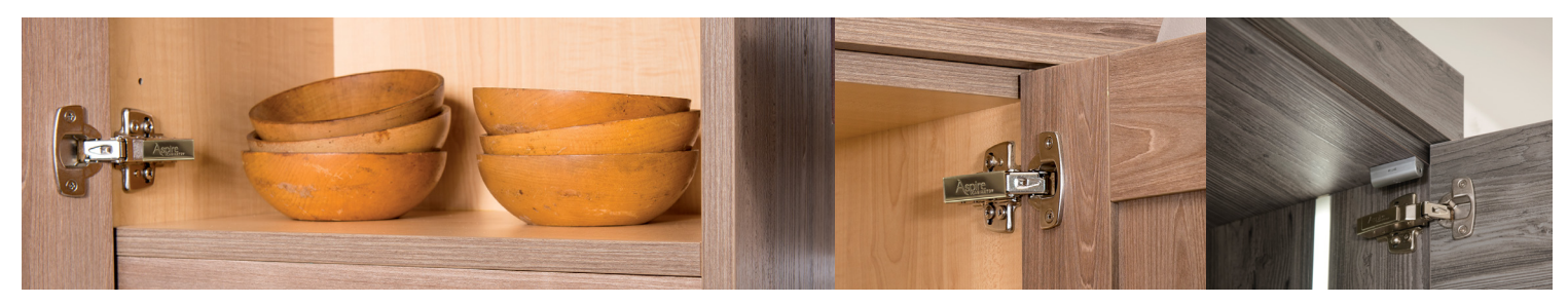
All doors have fully concealed Euro cup hinges with a six-way adjustability. These door hinges include self-closing integrated soft close features, for that ever so quiet close.

Wellborn stays abreast of the latest innovations in cabinetry design enabling us to offer you superior cabinetry construction. All of our cabinets are built from quality materials and crafted by people who care.