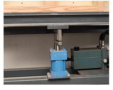
We regularly perform KCMA standard level static loading tests for wall cabinets to ensure the cabinets will stay on your walls thereby meeting KCMA standard requirements.