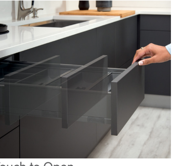
Touch to Open