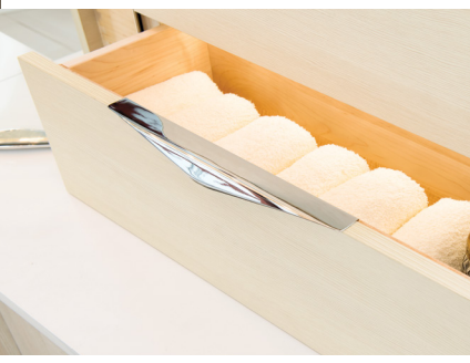
Illuminate Your Space