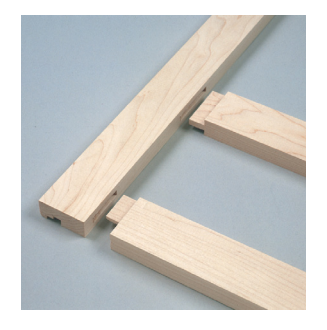
The mortise and tenon joints on the face frame are glued and locked into place by hand, and are carefully inspected by trained eyes for quality.