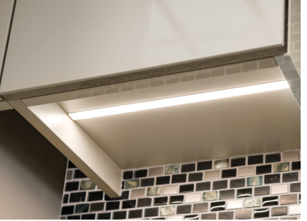
Illuminate Your Space