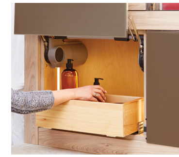
Touch to Lift