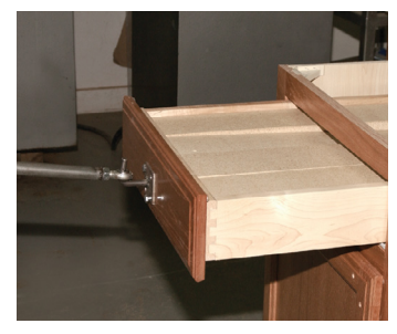
We also test the ability of our drawers and drawer slide mechanisms to operate properly during normal usage. KCMA requires 25,000 cycles. Our drawers regularly exceed this requirement without failure.