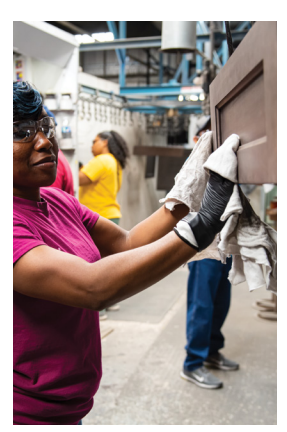
After the color stain is high pressure sprayed, the surfaces are hand rubbed to enhance the wood grain characteristics.