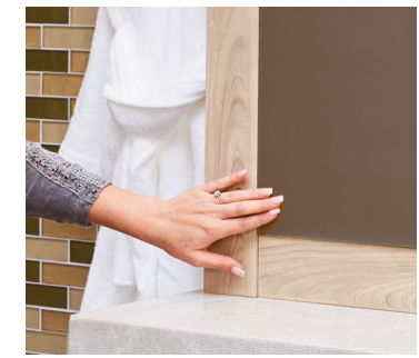
Touch to Open