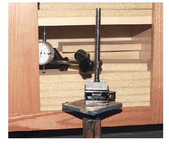
Cabinetry shelves are tested to determine their ability to withstand loading without incurring any structural damage or excessive deflection. Wellborn cabinetry meets standard KCMA tolerances.