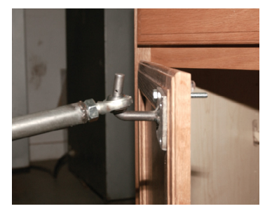
We test the ability of our doors and hinges to operate properly during normal usage. KCMA requires 25,000 cycles. Our doors regularly exceed this requirement without failure.