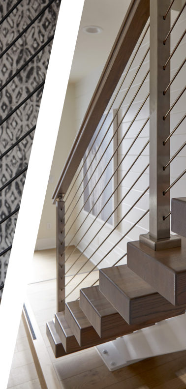
Stainless Rods Infill