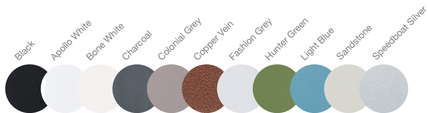
Powder Coat Colors