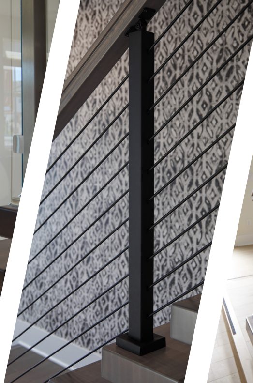
Onyx Rods Infill