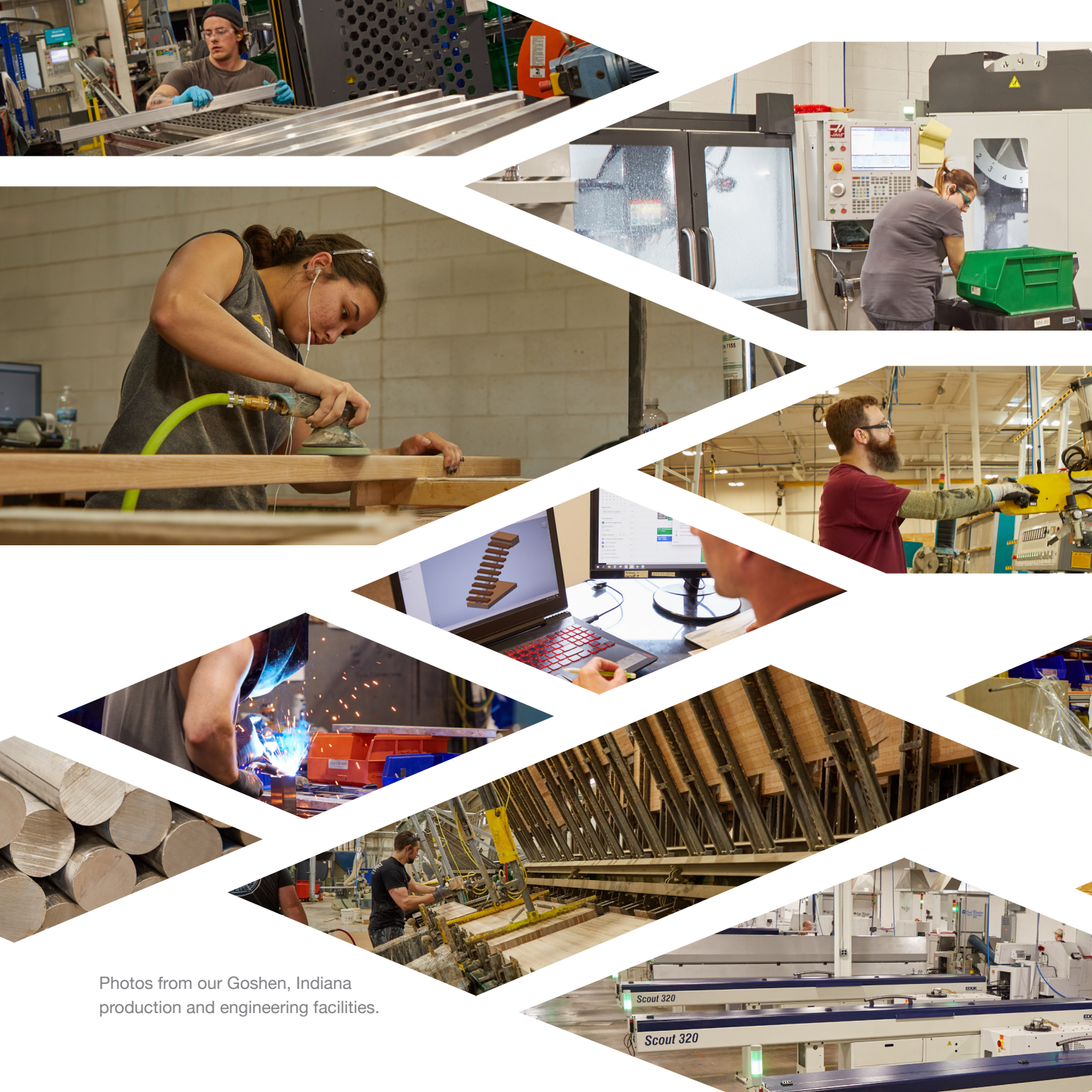
Photos from our Goshen, Indiana production and engineering facilities.